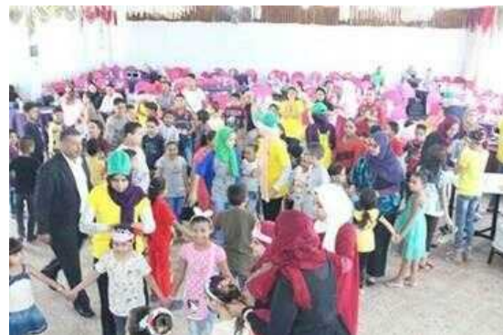
ADM's School Day