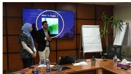
STEM student teams presenting winning projects